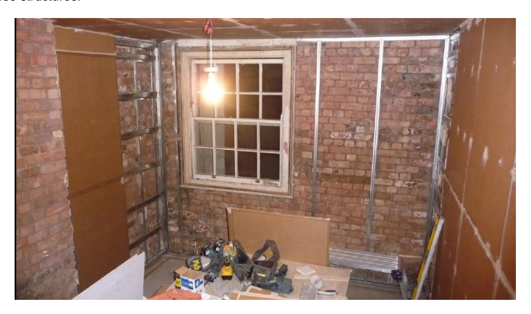
The PhoneStar boards are screwed to the resilient bars only using 25mm drywall screws. These screws must NOT penetrate into the wall. If possible fix the boards in a brickwork formation. Butt the boards tightly up to each other and to the perimeter walls, floor and ceiling. Ensure the PhoneStar board edges are sealed with PhoneStar Eco-tape after cutting to minimise sand spillage.

Resilient Bars are then installed horizontally on to the C studs at 600mm centres. The bottom bar should be positioned close to the floor and the top bar should be close to the ceiling but they must NOT touch the floor, the ceiling or the surrounding walls as this will cause noise to transfer into these structures.