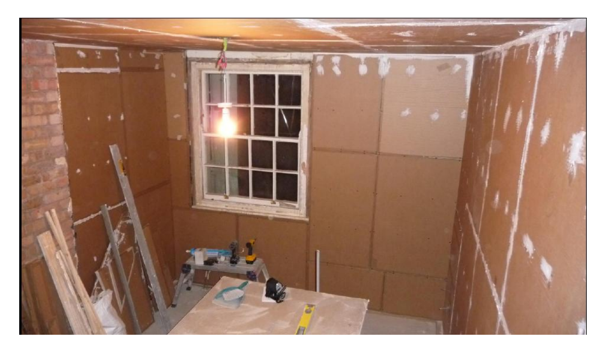
The PhoneStar boards can optionally be sealed with flexible sealant at the joints and perimeter, to ensure there are no gaps to allow sound to escape through. The screw heads are also sealed in this case.