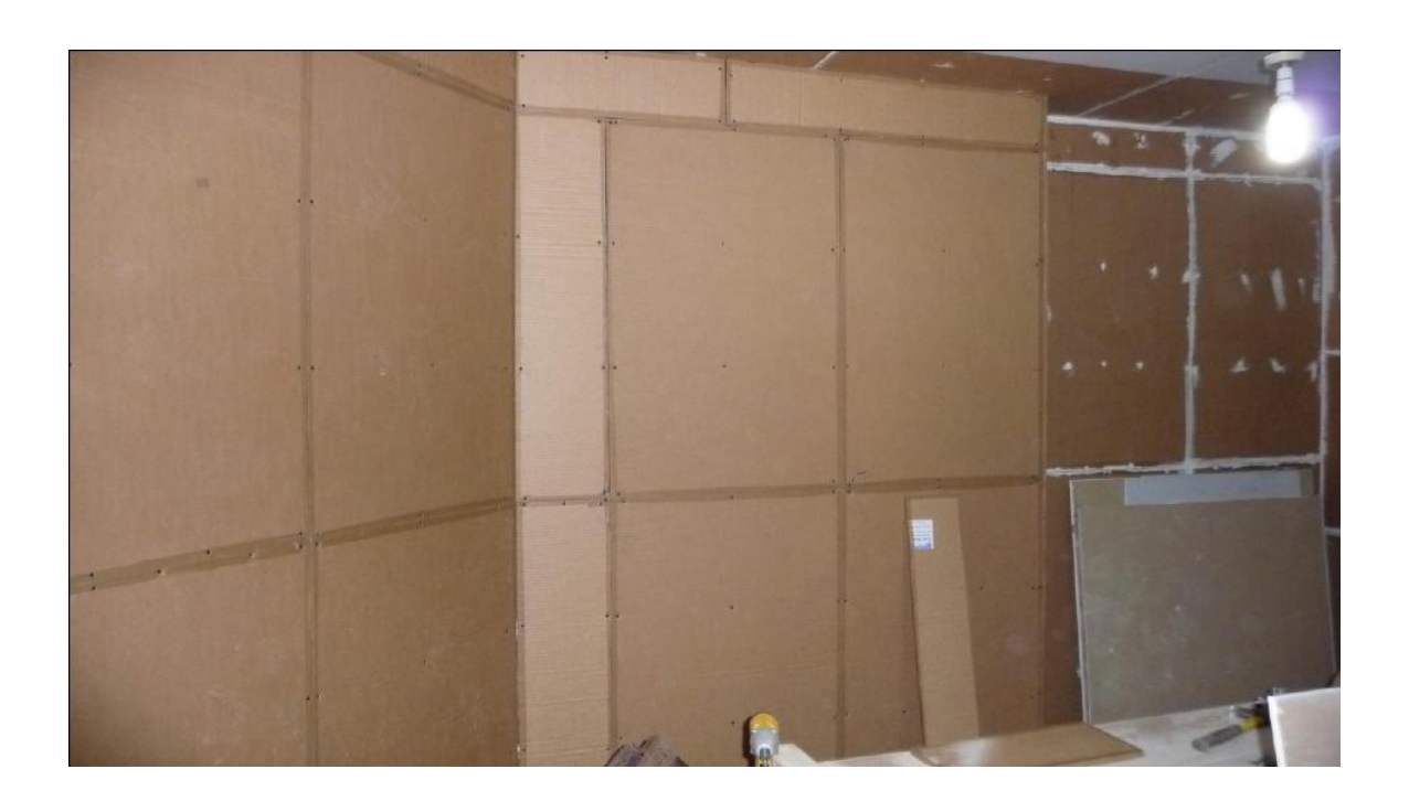
This wall has been completely covered in PhoneStar boards so that they are tightly butted up to the PhoneStar boards on the ceiling.