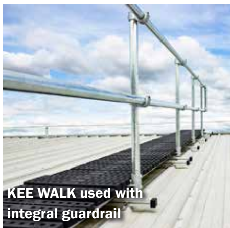
KEE WALK used with integral guardrail