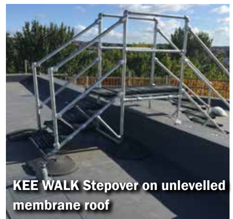
KEE WALK Stepover on unlevelled membrane roof