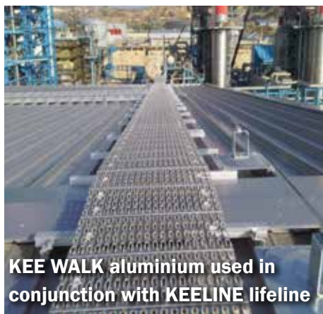
KEE WALK aluminium used in conjunction with KEELINE lifeline

Can be used in conjunction with others products to provide a complete fall protection plan.