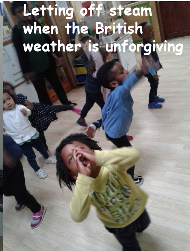
Letting off steam when the British weather is unforgiving