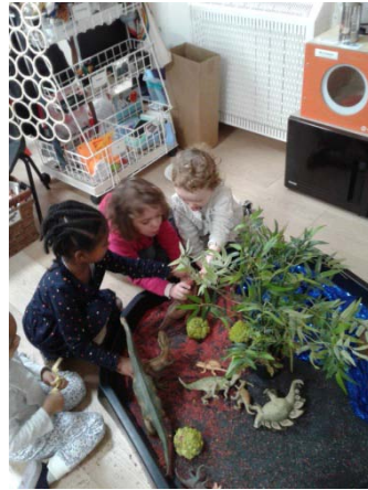
...they decide to build a dinosaur habitat in place of the Home Corner.