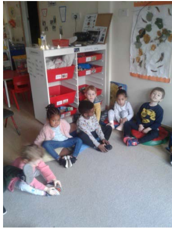
We bring this up at Reflection Circle and leave the idea with the children