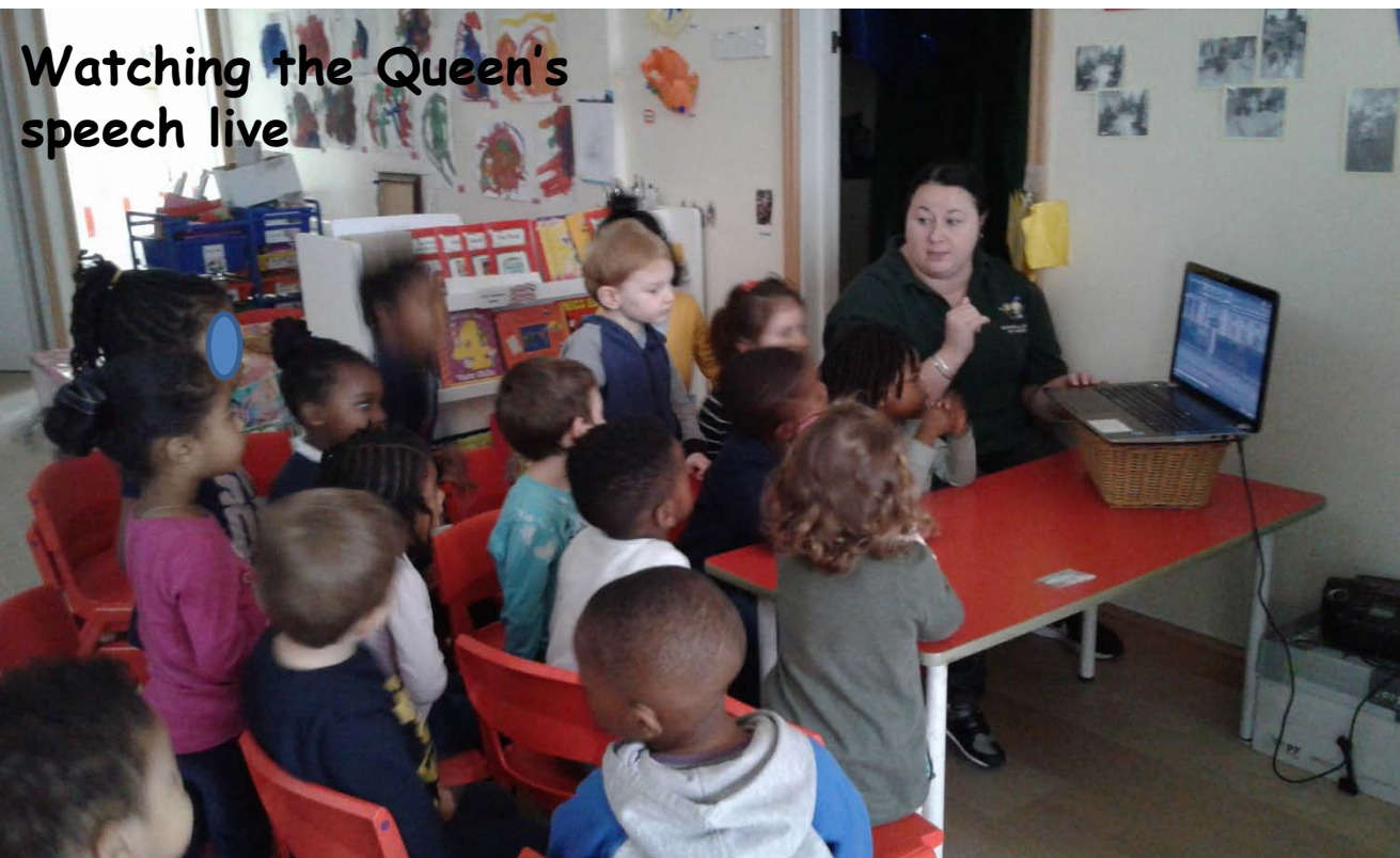
Watching the Queen's speech live

We want nursery to be fun and interesting...we consider variation every day.