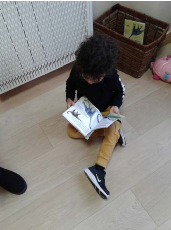
We noticed that ----- was very interested in the Dinosaurs book.