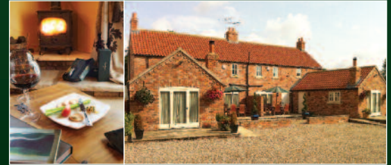
Blue Bell Inn