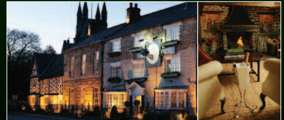
The Black Swan