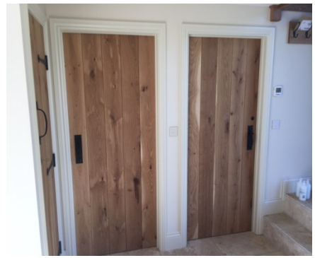
Contrasting walls and Doors