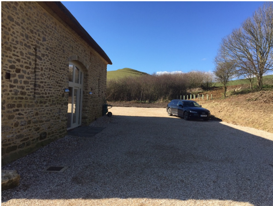
Parking at Merry Hill Barn