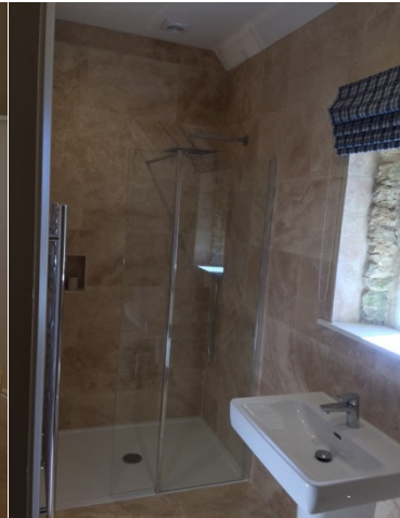
Double Ensuite Shower