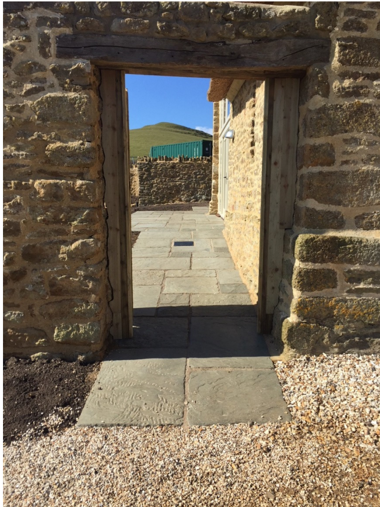
Path to Front Entrance