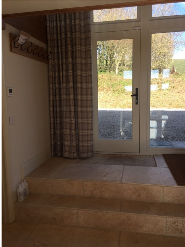
Main Entrance Steps