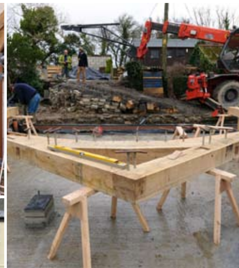
Far left: The scale of the project required a crane