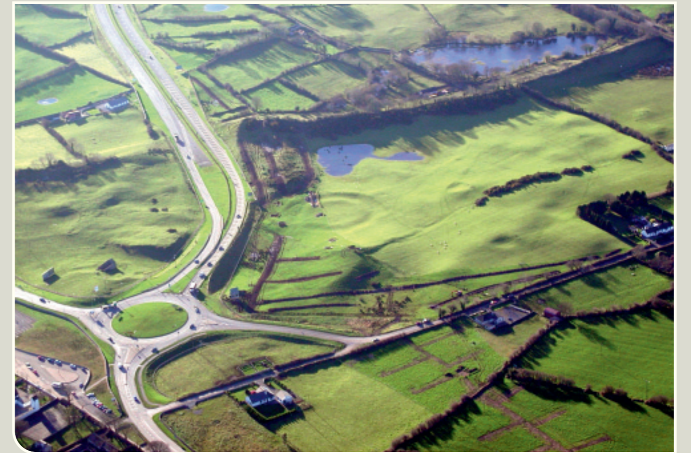
Aerial view of test trenching and henge at Tonafortes .

Most of the 30 sites excavated, with the exception of an early medieval ringfort, were prehistoric in origin, predominantly Neolithic and Bronze Age in date. Of these, a single site can be clearly interpreted as settlement—three Bronze Age round houses in the townland of Caltragh , though a probable Iron Age hut was identified at Magheraboy . Spreads of burnt mound material and fulachta fiadh /burnt mounds account for 17 of the sites excavated, while a causewayed enclosure, a ceremonial enclosure, a drystone-walled enclosure, six cremations, a possible megalithic tomb and two clusters of Late Neolithic pits accounted for the remainder.