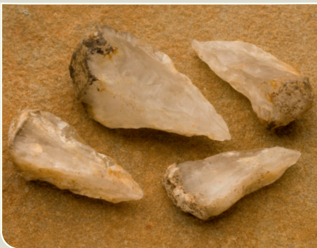
Selection of quartz from the causewayed enclosure at Magheraboy .