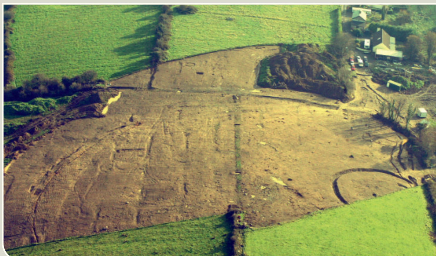
Aerial view of Neolithic causewayed enclosure and medieval ringfort excavated at Magheraboy .