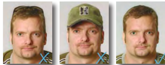
sunglasses on head

The photograph must show you without any hat or other head covering. However, if you wear a head covering for religious reasons we will accept a photograph of you wearing it, but your facial features from the bottom of your chin to the top of your forehead, and both edges of your face, must be clearly shown.