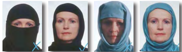
full face not visible