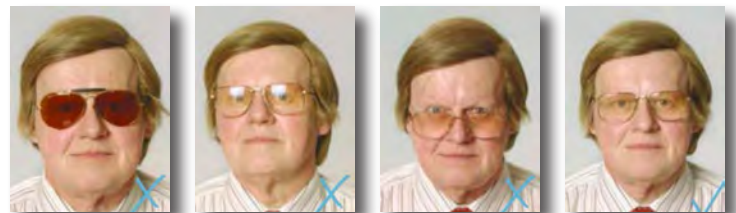
lenses too dark