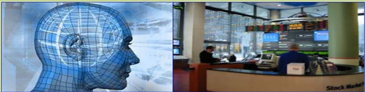
The Knowledge Market

[Wealth Creation & Knowledge Value Innovation in the New Economy]