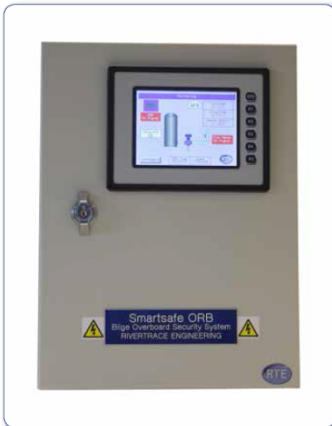
SmartSafe ORB - Bilge Overboard Security System