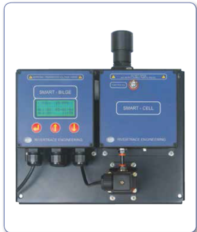
Smart Cell – MEPC 107 (49)