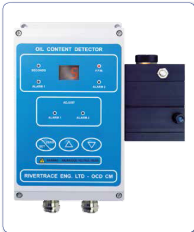
OCD CM - MEPC 60 (33)

This system may be installed in line with any new and existing IMO MEPC 60(33) and 107(49) approved monitors.