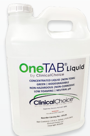
Item No. OTL25 Qty. CA/2 2.5 Gallons