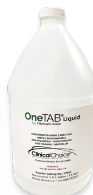
Item No. OTL01 Qty. CA/4 1 Gallon

OneTAB ® is designed to optimize cleaning results in the pre-conditioning, manual, and automated cleaning of endoscopes and surgical instruments before their reprocessing.