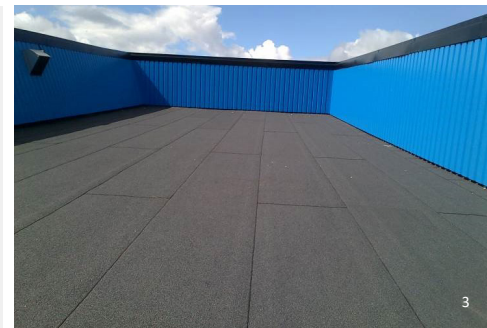
MAIN IMAGE AND RIGHT: FINISHED PROJECT.