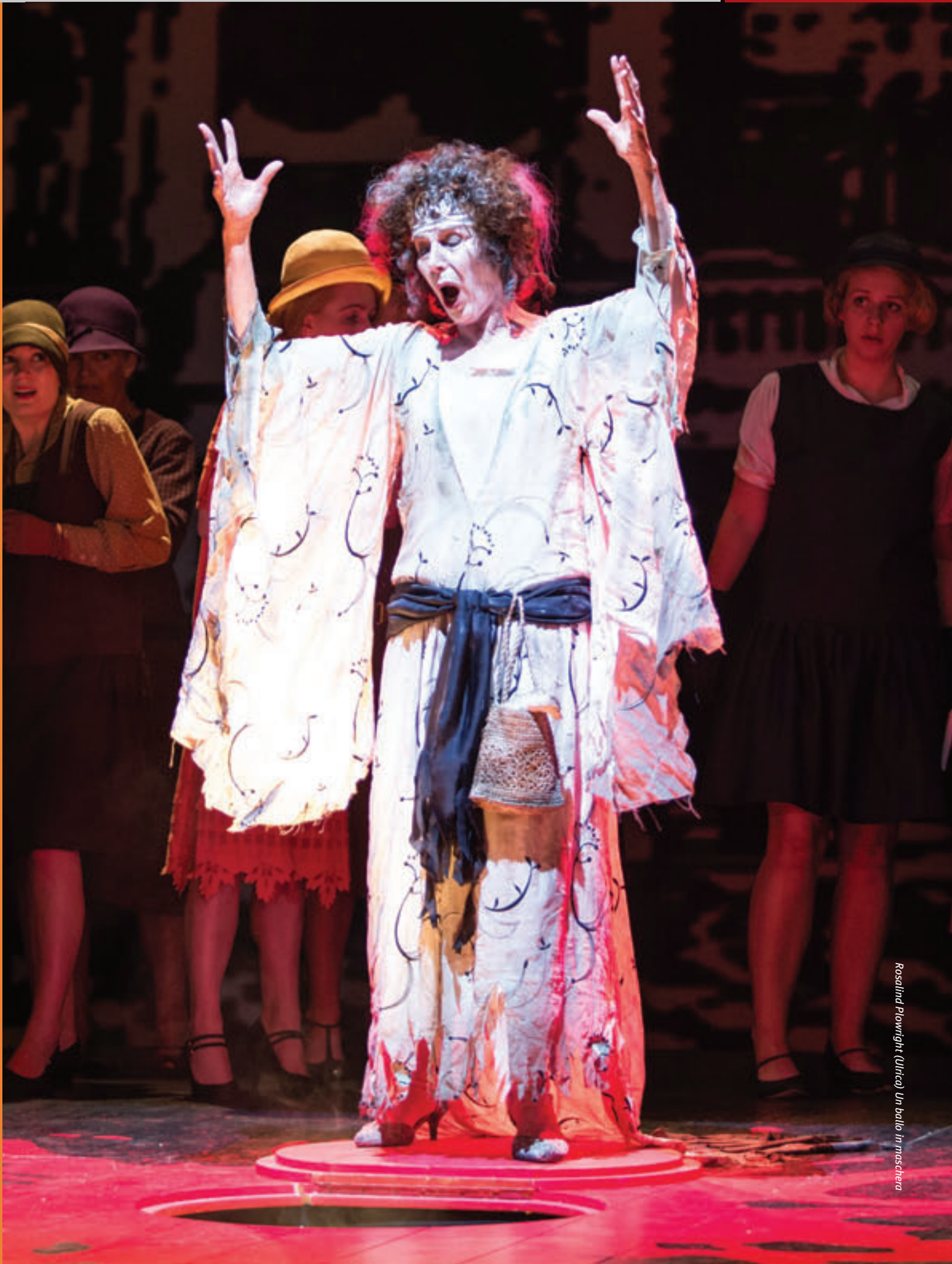
Rosilind Plowright (Ulrica) Un ballo in maschera