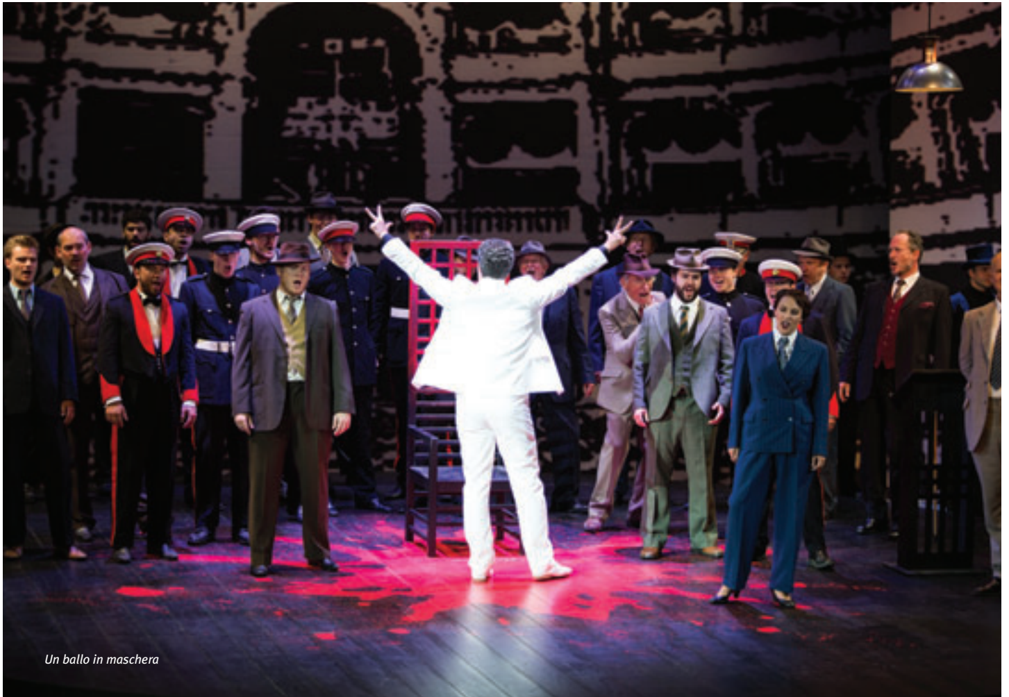
Un ballo in maschera