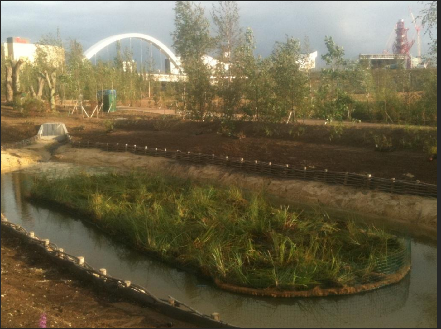
The rafts were planted with pre-established coir pallets and a goose anti-predation fence installed.