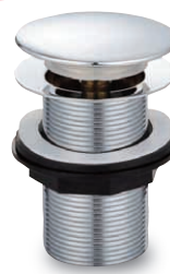
1 1/2" Bath Hair Catcher Waste