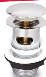
1 1/4" Basin Hair Catcher Waste