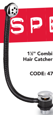
1 1/2" Combi Bath Hair Catcher Waste