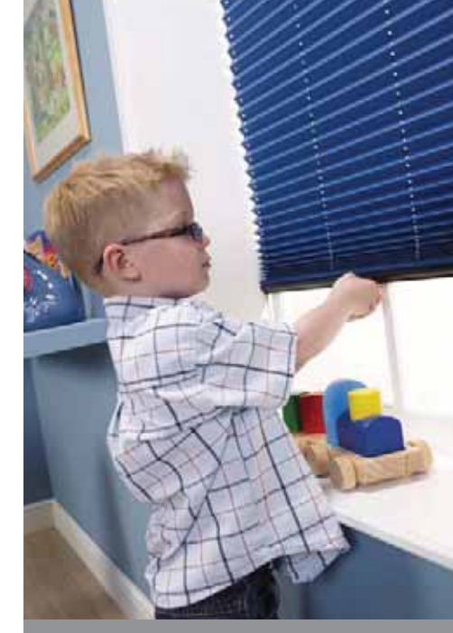
If you have young children we encourage you to also consider the small safety features that can be added to your blind, to help prevent cords or chains from posing a potential hazard

Our Easy Glide system for vertical blinds also eliminates the danger of children becoming entangled in cords as the blind is manufactured with a wand control. Simply pull the wand across your window to open and close the blind. To alter the amount of light entering your room, you can rotate the louvres by twisting the wand.