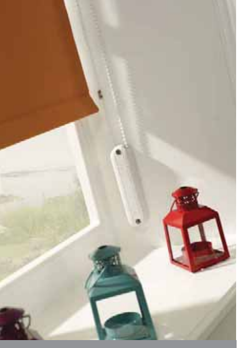
Young children can be in danger of strangulation from the loops of pull chain and bead cords that so often run through and operate window coverings