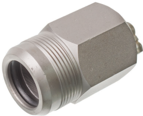
Original style O-rings install in the groove inside the bushing as shown.

Note: When installing ensure the shaft is properly oriented and centered on the bushings so full shaft rotation is possible.