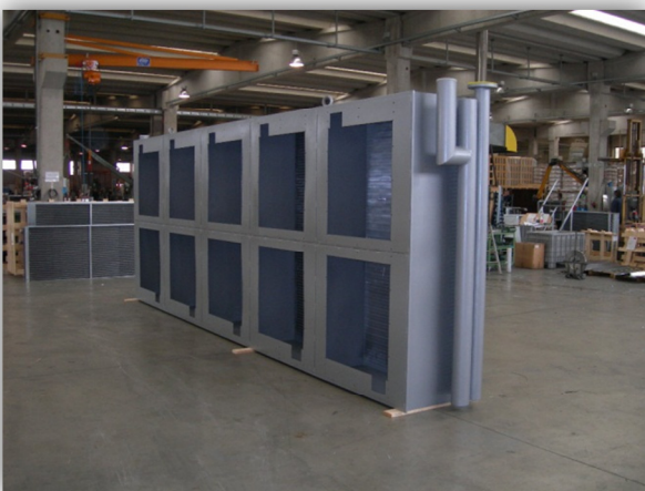
Replacement Coil in Production