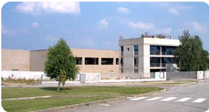
Dbm Coils S.p.a.

The main factory is located in Varallo Pombia, in the North West of Italy, close to Milan and Malpensa Airport. Our other plant, Geo.Coil is situated in Artegna, in the North East of Italy, close to the borders with Austria and Slovenia. The company employs over 140 people.