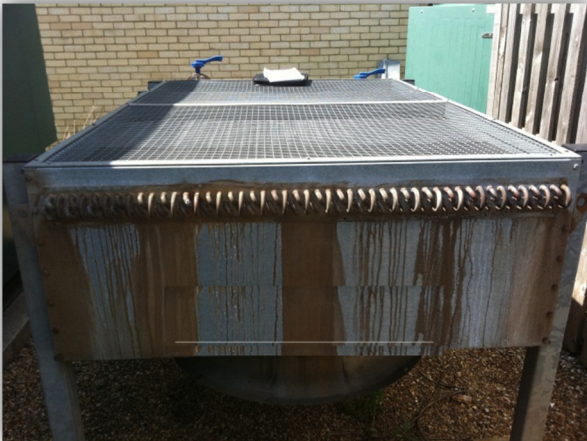
Leaking Dry Cooler Coil