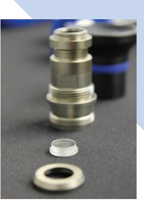
Eye piece broken down