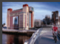
Baltic Centre, Gateshead