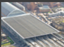
St Pancras, London