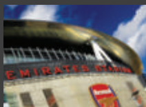
Emirates Stadium, London