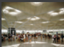
Passenger Terminal, Stansted Airport