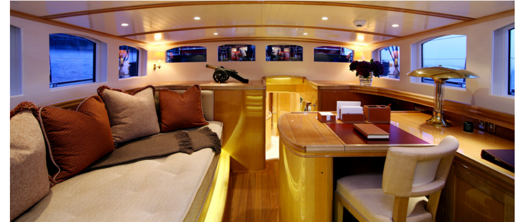
Aft of the main deckhouse is the owner's cockpit with its own deckhouse, providing direct access to the master suite. This privacy concept offers a remarkably peaceful and quiet place, even at sea when sailing at full speed with guests on board.