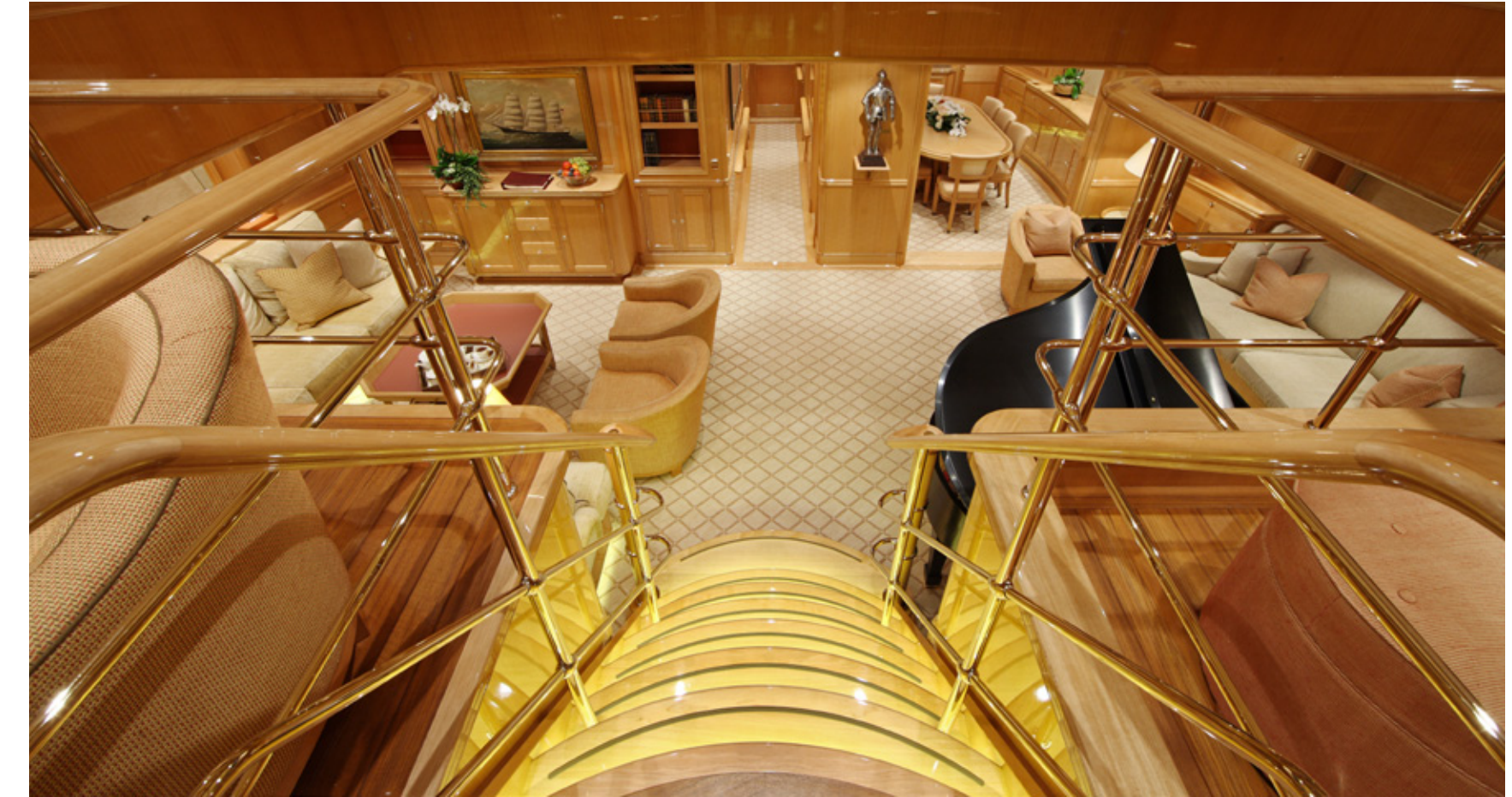
A formal dining room is located forward and to starboard of the main salon. This area can be closed off to offer the privacy if desired. The oval table is situated below an artistic mirrored skylight. The luxurious VIP guest stateroom to port also benefits from spectacular views to the stars via the skylight. Two more guest suites are situated aft of the main deckhouse.