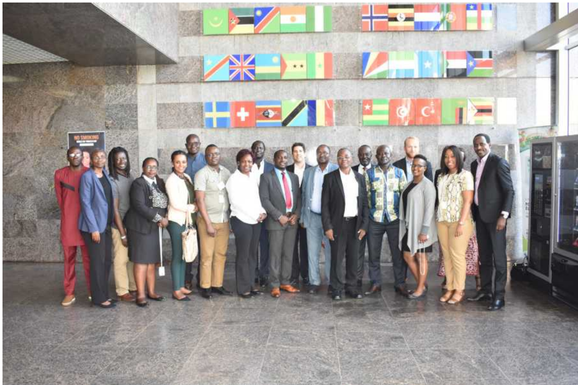
SVNP Members at the AfDB Headquarters in Abidjan