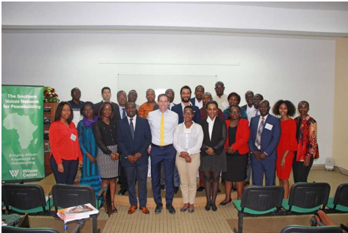
SVNP Conference delegates