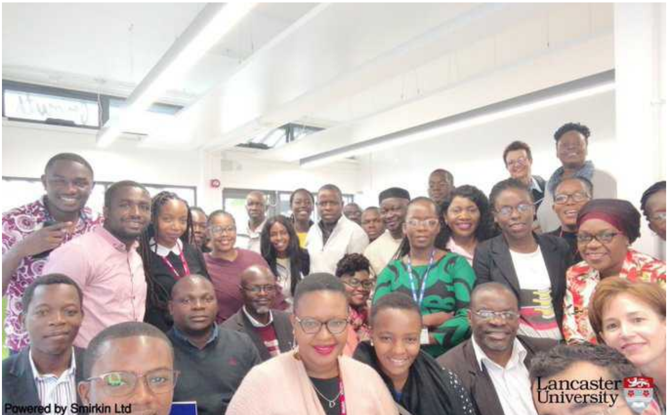
Recirculate Residence Attendees at Lancaster, UK