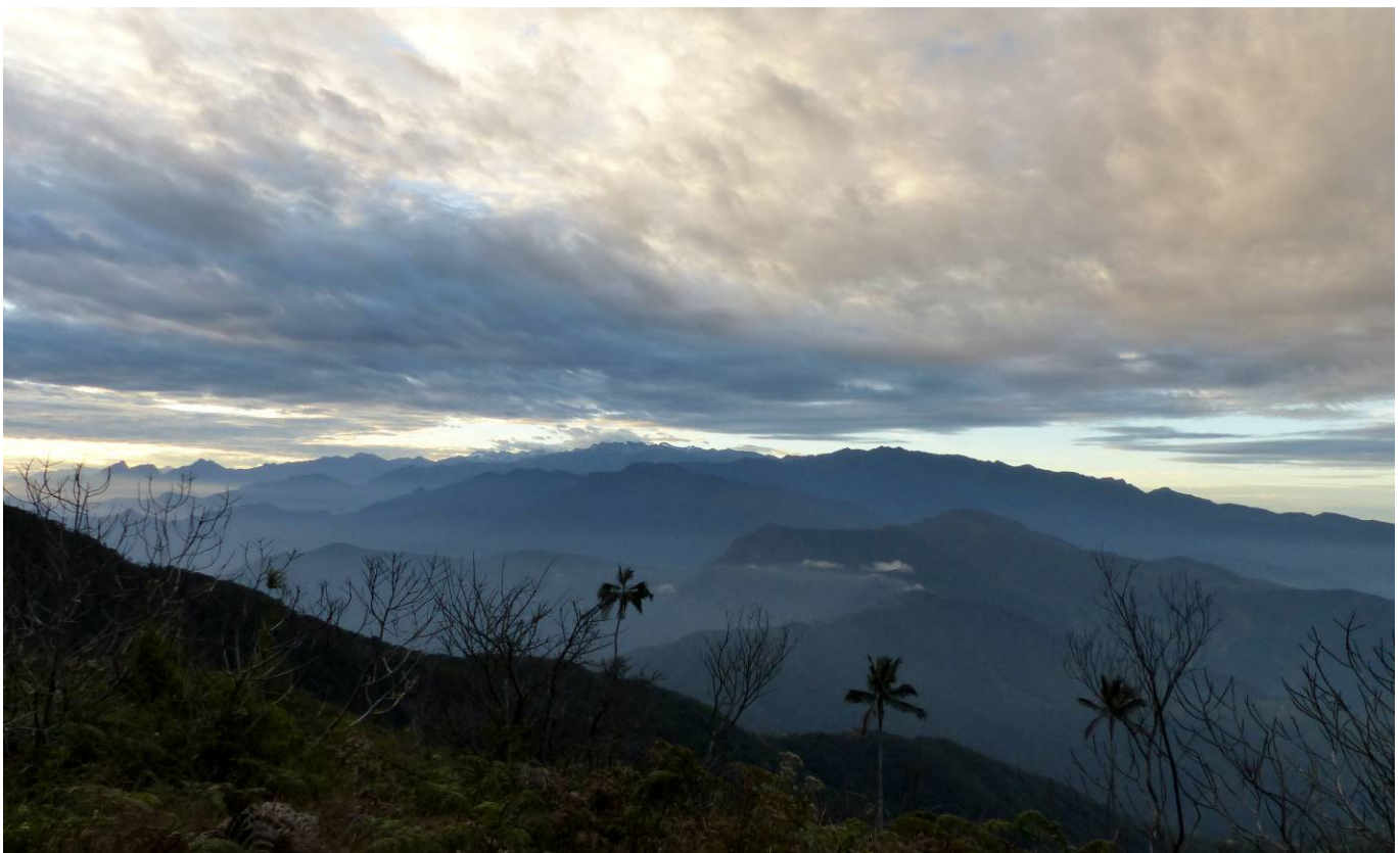
Front cover - White-tipped Quetzal.