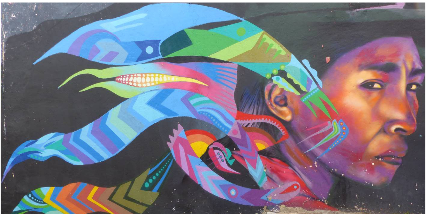
Above - street art in Bogotá.