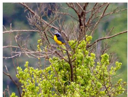
Left to right - Crab-eating Fox; Blue-naped Chlorophonia; Black-and-white Owl; Masked Trogon; Slate-throated Whitestart; Santa Marta Glass Frog; Yellow-crowned Whitestart; False Daggerwing; Santa Marta Antpitta; White-tailed Starfrontlet; Black Phoebe; Red-tailed Squirrel; Santa Marta Mountain Tanager.