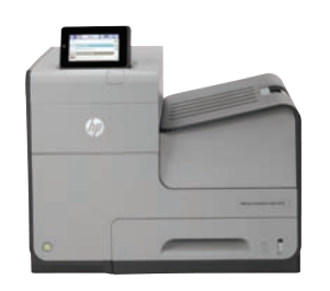
HP Officejet Enterprise Color X555dn

A printing revolution for your enterprise. Produce color documents at up to twice the speed and half the cost per page of color lasers.<sup>1,2</sup> Designed with advanced security and full manageability, this enterprise printer is built to last.