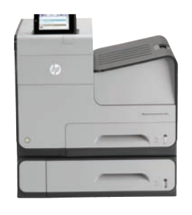
HP Officejet Enterprise Color X555xh