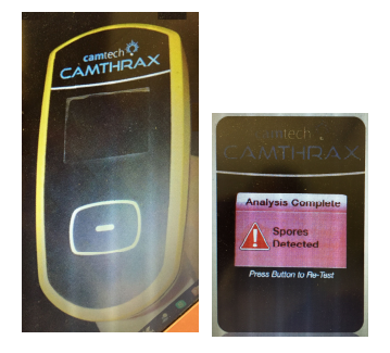
CAMTHRAX , the world's only portable reagentless anthrax biothreat screening unit