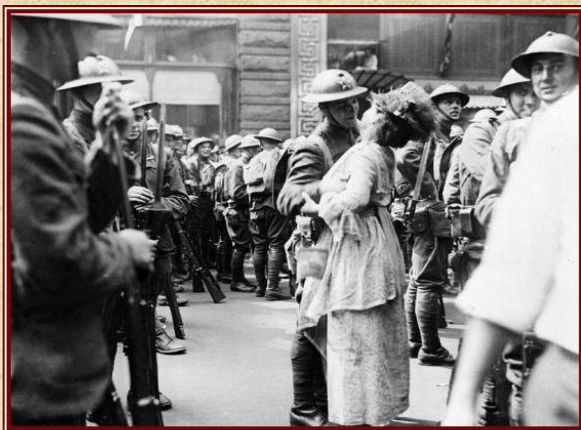
A U. S. marine from the 2 nd Division. This photo looks familiar somehow.

The Fighting Ended Nov. 11, 1918 at 11:00 AM