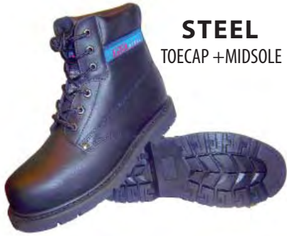
STEEL TOECAP +MIDSOLE