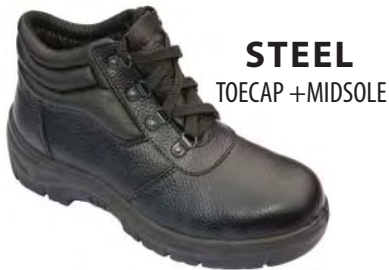
STEEL TOECAP +MIDSOLE