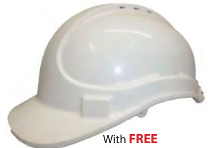
With FREE helmet chinstrap