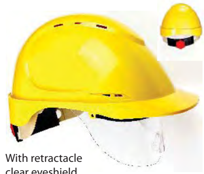
With retractable clear visor