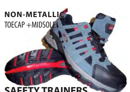
NON-METALLIC TOECAP +MIDSOLE