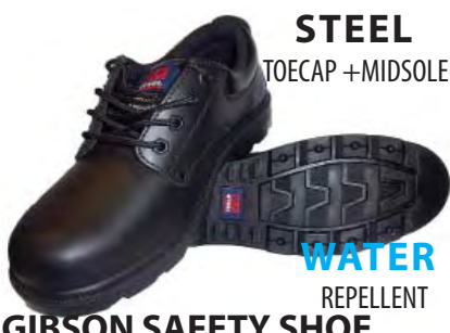
STEEL TOECAP +MIDSOLE WATER REPELLENT