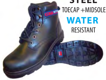
STEEL TOECAP +MIDSOLE WATER RESISTANT