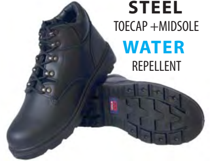
STEEL TOECAP +MIDSOLE WATER REPELLENT