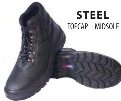
STEEL TOECAP +MIDSOLE