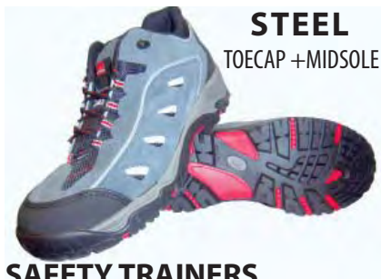
STEEL TOECAP +MIDSOLE