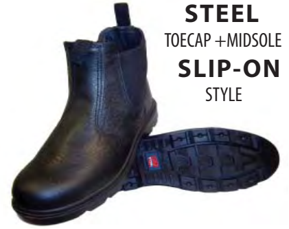
STEEL TOECAP +MIDSOLE SLIP-ON STYLE