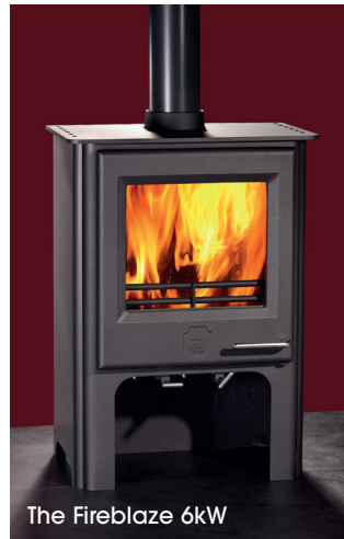
The Fireblaze 6kW