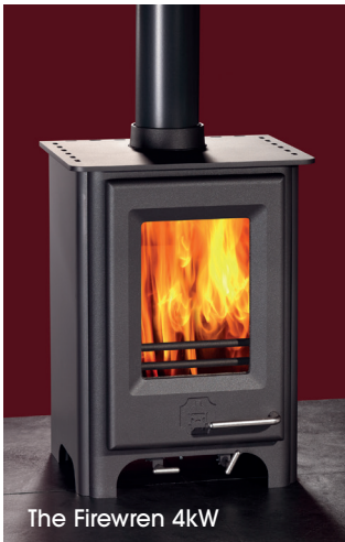
The Firewren 4kW

Metal Developments Ltd reserve the right to change their specifications at any time.