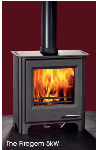
The Firegem 5kW