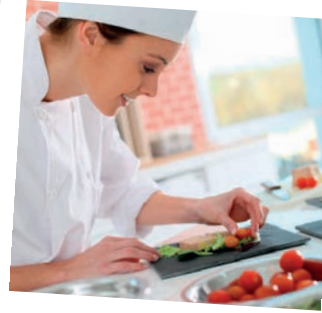
Catering for all tastes!

Our Catering Team provides a wide range of freshly prepared meals to suit all tastes - and any specific treats, needs or allergies can be catered for.