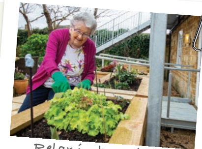
Relax in beautiful and accessible cottage garden retreats