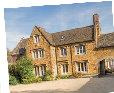
Nestled in the idyllic Oxfordshire village of Deddington

We go to great lengths to make everyone's stay truly enjoyable in a homely, relaxed and safe atmosphere for you, your guests and our staff.