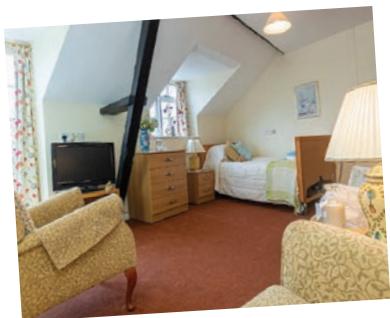
We make it really personal!

Featherton House is a beautiful listed building, sympathetically converted into a Retirement and Respite Care Home, combining gracious Georgian surroundings with the highest standards of service.