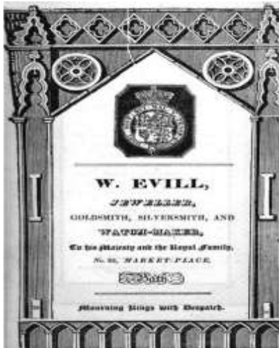
Evill business advertisement