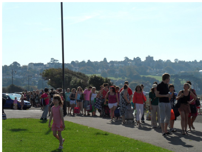
Queue on Saturday just before 2pm opening

Volunteers and staff felt their efforts were rewarded by the wonderful atmosphere and the obvious appreciation of so many visitors. With the unexpected boost to our finances, the Trust will be able to buy a commercial underwater pool cleaner. This is an environmentally friendly option which will also save money in refilling the pool.