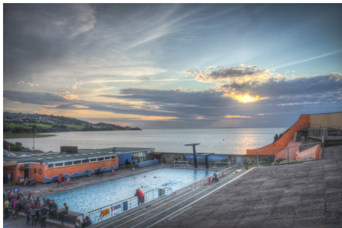
And the sun sets on another season

We plan to open the 2012 season on 21 April, the 50 th anniversary of the opening of the Pool, but will be watching the weather closely to see if this can be brought forward so watch out for further announcements nearer the date on our website or in the newsletter.