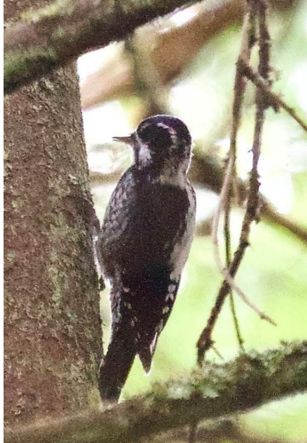
Top: Baltic Ringed Seal and American Mink Bottoms: Willow Tit and Three-toed Woodpecker