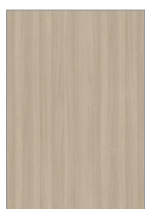
Light Springfield Oak Y2109-Q3