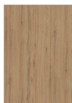
Natural Chalet Oak Y1610-Q5