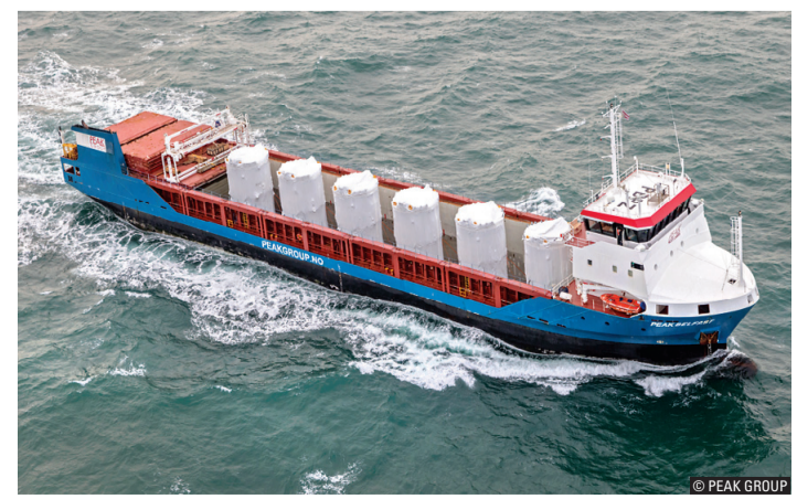
The Peak Group is continuously developing and enlarging its fleet.