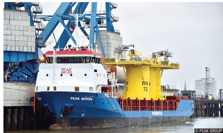
The company is a proud member of the Norwegian Shipbroker’s Association.

“As we grow our business, invest in our people and win new customers, we will remain a strong commercially driven industry leader. We are very much looking forward to the next