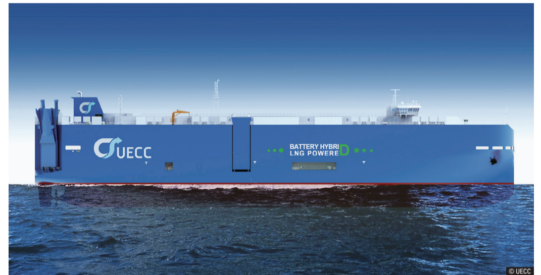
Artist’s impression of UECC’s new Battery Hybrid LNG PCTC. The first in a series of three to be delivered to UECC in the middle of 2021.