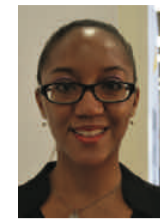
Saelese Haynes Ministry of Energy and Energy Industries Trinidad and Tobago

Public international law is an area we are seeing a lot of interest in, especially in light of terrorist attacks and other global issues. International arbitration and white collar crime defence and compliance are also increasingly important.