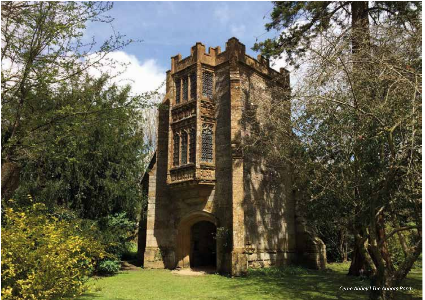
Cerne Abbey | The Abbots Porch