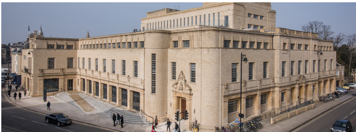
The Weston Library