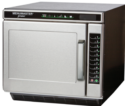
Model JET514 shown