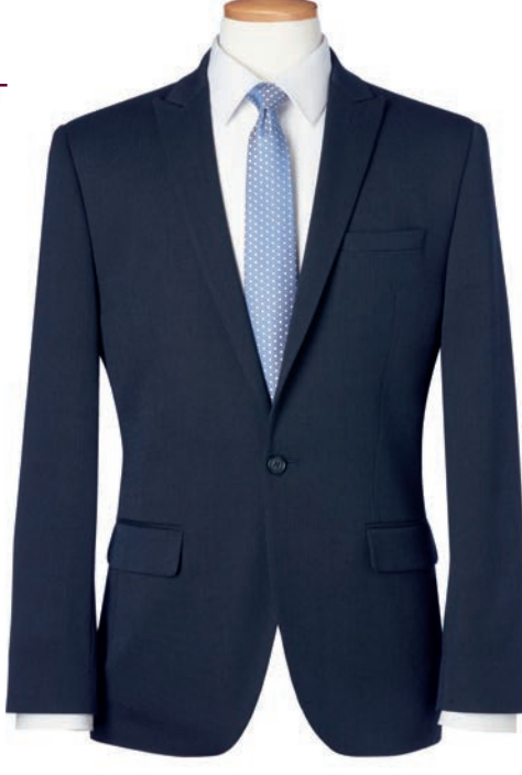
Centre back length at size 40R =76cm