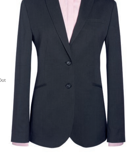
Centre back length at size 12R = 63cm