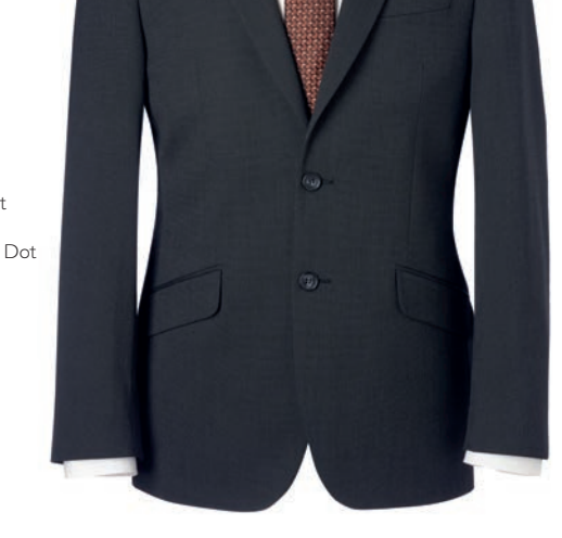
Centre back length at size 40R =77cm