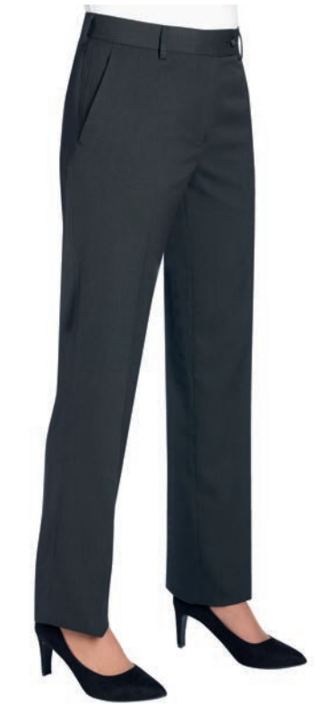
21cm Half hem width at size 12 = 21 cm

2277B Navy 2277C Charcoal Pin Dot 2277D Black