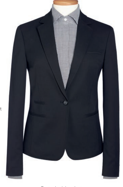
Centre back length at size 12R = 55.5cm