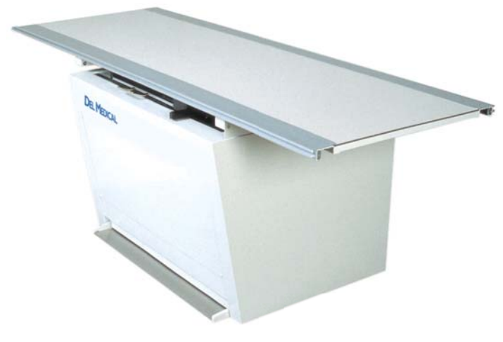
RT100 Four-Way Float Top Table