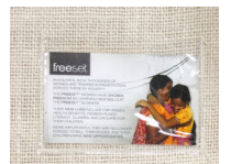
plastic name card holder