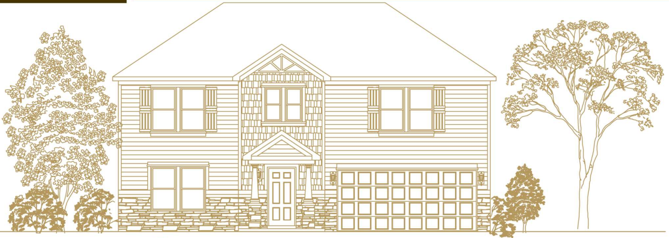
Featured Elevation Elevation Scheme 3