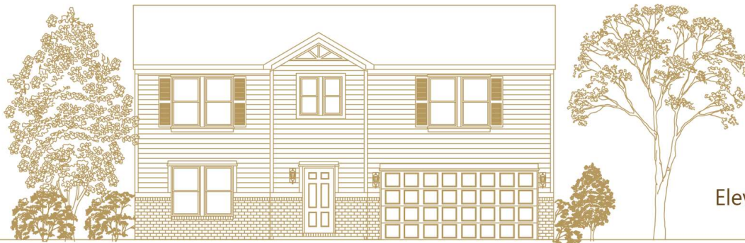
Elevation Scheme 1