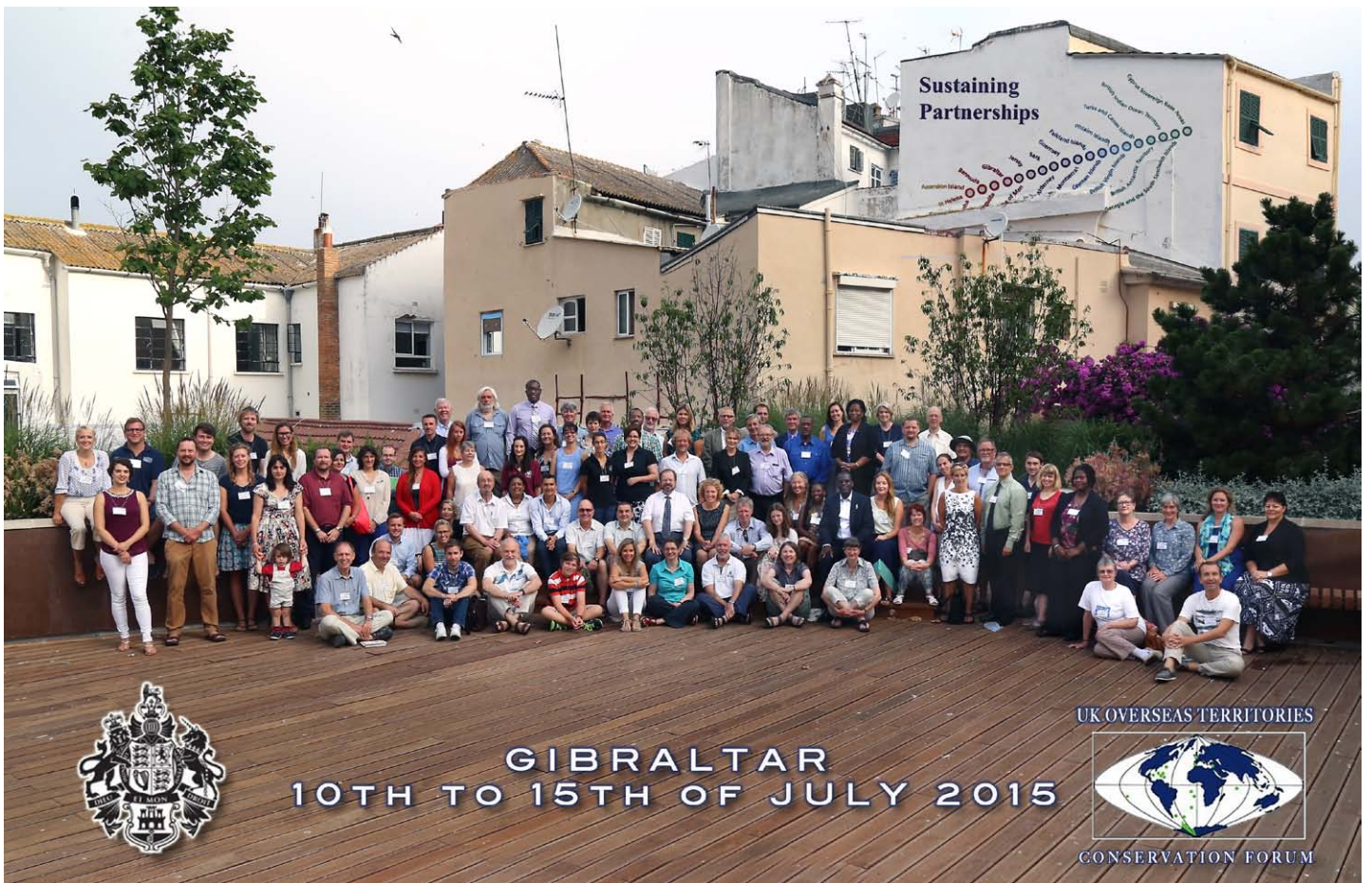
The conference participants