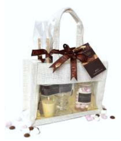
Hot Chocolate Gift Bag CODE: HCGB