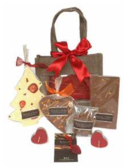
Chocolate and Candles Gift Bag Case of 4 £13.95 each (£55.80) RRP £18.99 Contains 2 x chocolate bars (1 x milk, 1 white chocolate), 1 x milk chocolate heart, 1 x milk chocolate nut clusters, 2 x heart candle votives

Case of 4 x 300g £13.95 each (£55.80) RRP £18.99