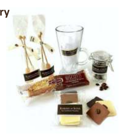
Little Italy Coffee and Chocolate Gift Bag contents: mug, glass mini jar, coffee beans, biscotti, sugar sticks, milk/white/dark chocolate squares