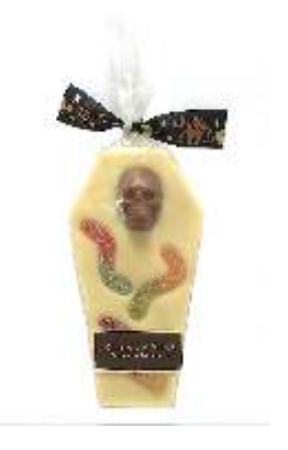
White and milk chocolate with sherbert jelly shapes CODE: WWCW