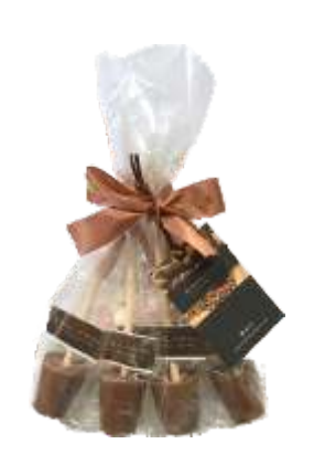
Hot Chocolate - 4 pack (All Milk) 4 x Individually wrapped hot chocolate stirrers, marshmallows CODE: HCSM

Case of 6 x 160g £10.35 each (£62.10) RRP £13.99