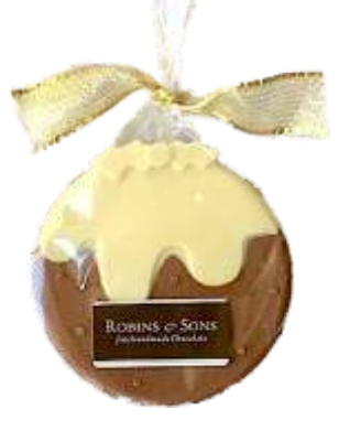
Case of 20 x 60g. £3.49 each (£69.80) RRP £4.99 Milk and white chocolate Christmas pudding bar CODE: PUD