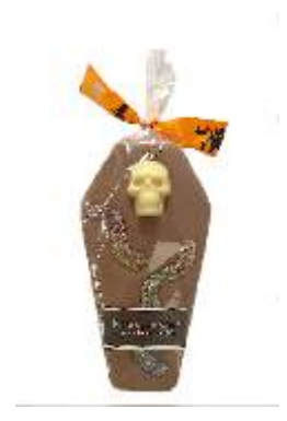
Milk and white Chocolate with sherbert jelly shapes CODE: WWCM

Case of 17 x 90g. £3.49 each (£59.33) RRP £4.99