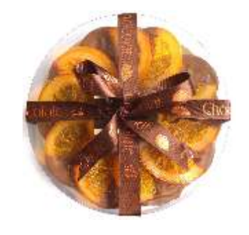
Whole candied orange slices in milk chocolate CODE: DIPOLM

Case of 8 x 90g £4.19 each (£33.52) RRP £6.99