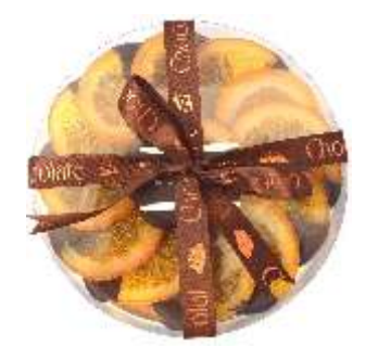
Whole candied orange slices in dark chocolate CODE: DIPOLD