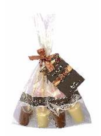
Hot Chocolate - 4 pack (Mixed) 4 x Individually wrapped hot chocolate stirrers (2 x Milk), 2 x WHITE), marshmallows CODE: HCSM