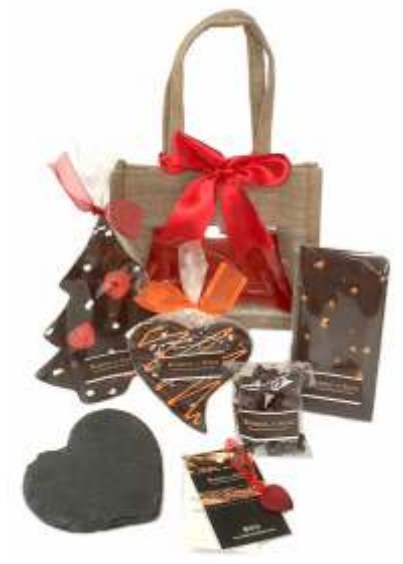
Chocolate and Slate Coaster Gift Bag Case of 4 £13.95 each (£55.80) RRP £18.99 Contains 2 x chocolate bars (2 x dark chocolate), 1 x dark chocolate heart, 1 x dark chocolate nut clusters, 1 x slate heart coaster CODE: RGBD