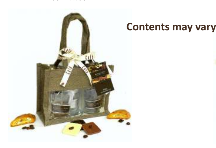
Little Italy Coffee and Chocolate Gift Bag CODE: COFFEEGB