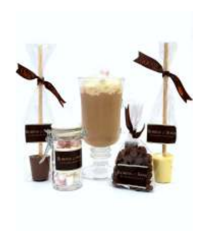
Hot Chocolate Gift Bag contents: mug, glass mini jar, 2 hot chocolate stirrers, marshmallows, chocolate chips