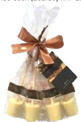
Hot Chocolate - 4 pack (All White) 4 x Individually wrapped hot chocolate stirrers, marshmallows CODE: HCSW