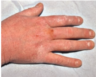
Irritant contact dermatitis

Contact dermatitis can vary from mild to severe. The skin can be dry, red or scaly.