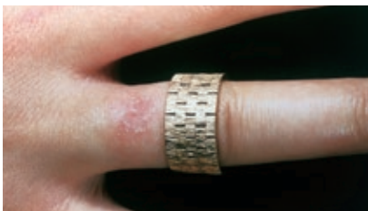
ICD under ring

Body If the skin is very dry then simply friction from clothes may produce ICD.