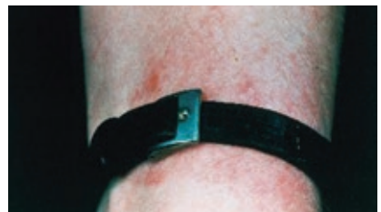
ACD to nickel in watch strap

Prevalence of contact allergens can change over time, for example, there is a new epidemic of (meth)acrylate allergy in the UK, brought about by the trend for acrylic nails (Rolls, Rajan, Shah, 2018).