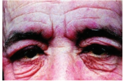
ACD on eyelids due to epoxy resin