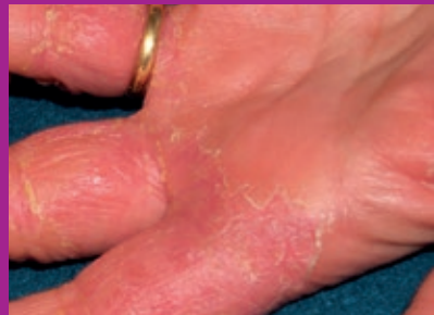
Hand ICD with a glazed surface, redness and scaling.

Hand ICD is particularly common. Friction, dust and extremes of temperature are all irritants. Irritants will also collect under rings and cause eczema between the fingers. It is important to remember that,