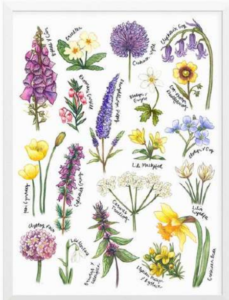
Print from: www.megantuckerillustration.co.uk

around to see what grows locally! In sunny positions go for knapweed, field scabious, meadow buttercup, lady's bedstraw, bird's foot trefoil, meadow cranesbill, yellow rattle, vetches, yarrow, selfheal, musk mallow, ox-eye daisy, betony, St John's wort, wild carrot, cowslip, primrose. For