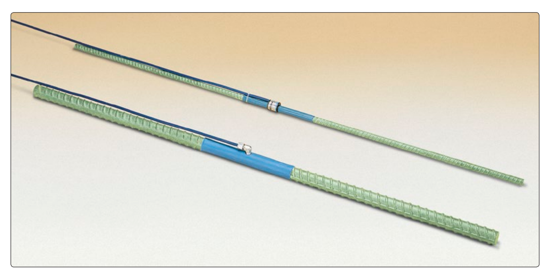
Model 4911A Rebar Strainmeter (front) and the Model 4911 "Sister Bar" (rear).