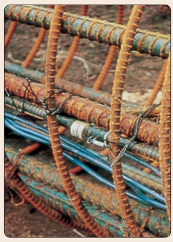
Close-up of Model 4911 shown as installed in concrete pile reinforcing cage.