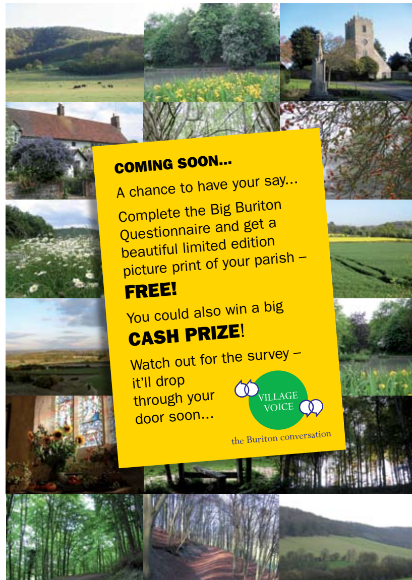
Appendix 4: Flyer promoting forthcoming Questionnaire Survey