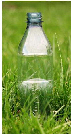
Produced from BioForm PX

Several leading PET manufacturers have oxidized BioForm PX paraxylene to TPA and subsequently copolymerized the TPA with bio-EG to bio-PET. The PET has been successfully converted to bio-based beverage bottles with the same properties, including clarity as conventional PET.