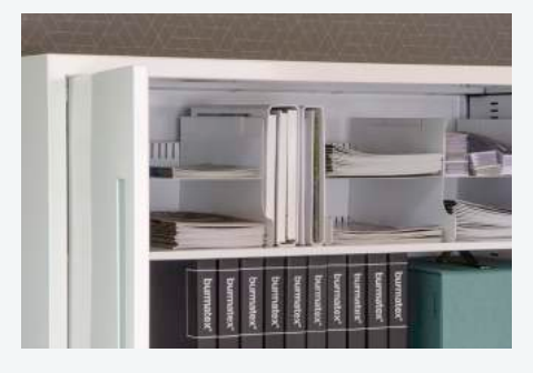
Pigeon Hole Shelf Suitable for traditional pigeon holes for internal mail or storing A4 and A5 forms or literature.