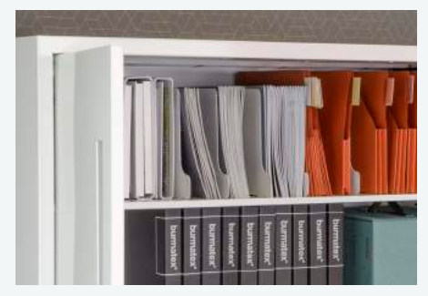
Slotted Shelf For use with dividers, a slotted shelf is useful for items that lack rigidity such as magazines, shelf files and wallets.