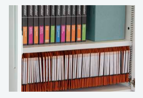
Lateral Plain Shelf with Fixed Rail This shelf stores items like a traditional plain shelf, but can also store suspension files on the rail under the shelf, providing greater flexibility.