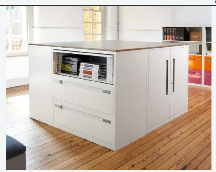
Top Image: Jot Combination storage with flipper and side filer compartments. Bottom Image: Jot Combination bookcase storage with 2 drawers and shelf.

Jot is a unique and flexible storage range which allows various drawer depths and independent locking mechanisms.