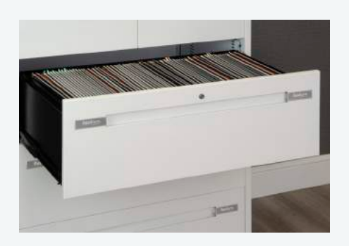
Side-to-Side Filing Suitable for drawers only, allows for suspending files side-to-side.