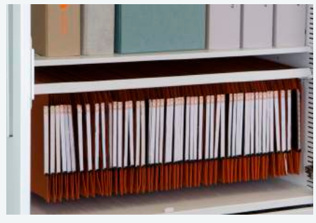
Lateral Suspended Filing Rails For fixed side-to-side suspension files.