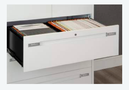
Front-to-Back Filing Suitable for drawers only, allows for suspending files front-to-back in 2 rows.